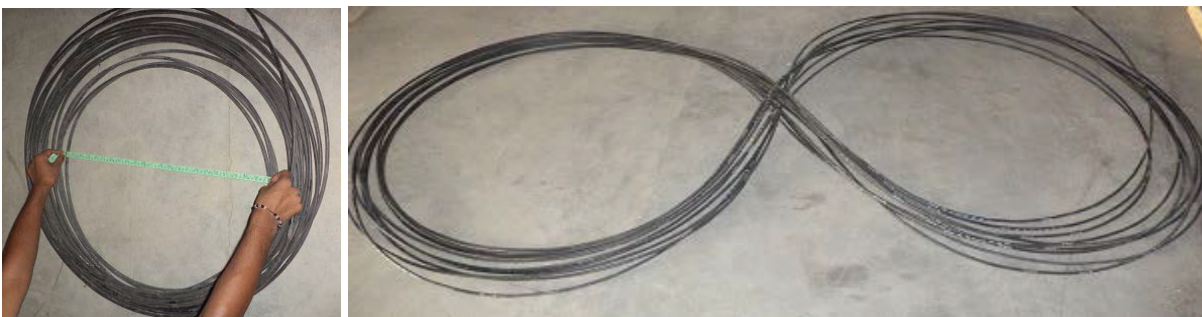
Figure 5 - Cable coiling in manhole or hand-hole and intermediate pulling/blowing

It is very important to maintain minimum bending radius while storing coiled cable at manhole & hand hole. During intermediate blowing and pulling, the cable storage should always be in Fig-8. Coiling in Fig-8 shape removes residual twists in the cable.