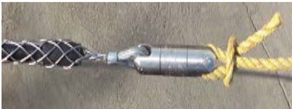
Figure 4 - Anti-twist device/ swivel placed in between cable end and pulling rope

It is strongly recommended to use anti twist device (also known as swivel) during cable installation by manual pulling or machine pulling. The swivel is to be placed in between cable grip (also known as ‘pulling eye’) and pulling rope as shown in figure 4 to remove the twist in cable and pulling rope. It is strongly recommended to use breakaway swivel during manual pulling installation. During manual pulling, applied pulling tension higher than the cable tensile rating can damage the cable and negatively impact its lifetime. The main function of breakaway swivel is to break the swivel if excess tensions compare to cable tensile rating is applied during cable pulling.