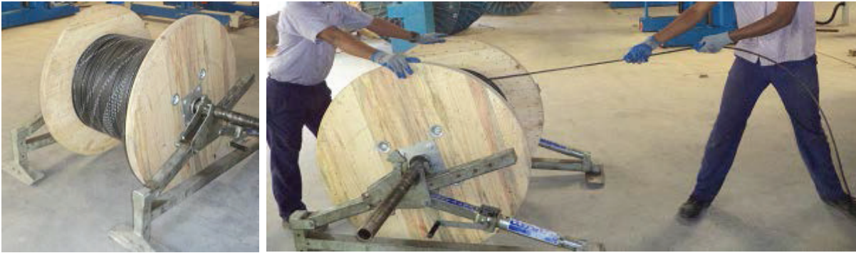
Figure 3 - Cable reel Pay off