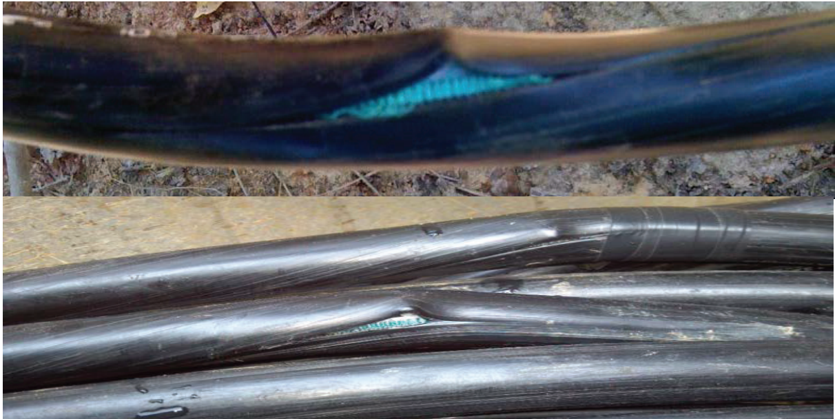
Figure 2 - Jacket 'Zippering'